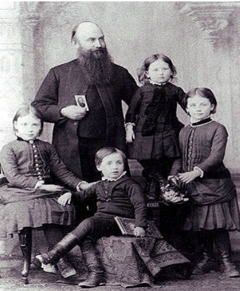
William Hechler and his family