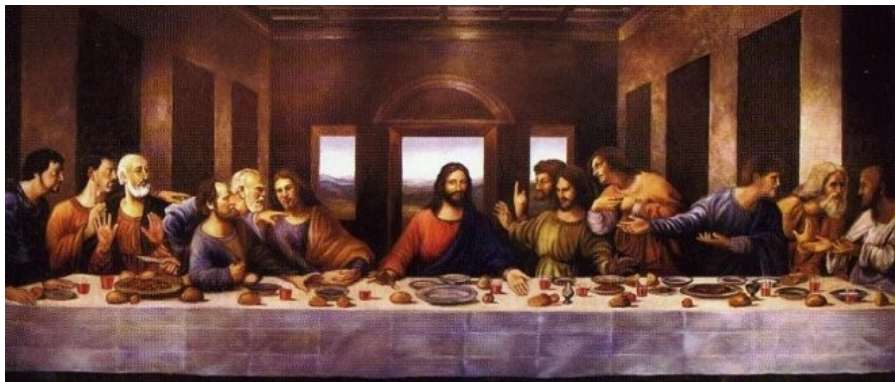
The Last Supper by Leonardo Da Vinci (1452 – 1519).

Additionally, it is important to note that Christianity was started amongst Jews who believed and followed Jesus. All the prophets were Hebrew. The disciples and apostles of Jesus were Jews and most importantly our Lord Jesus himself was a Jew who lived and died amongst Jews, so that both the Jews, and we ourselves (the gentiles) may be saved.